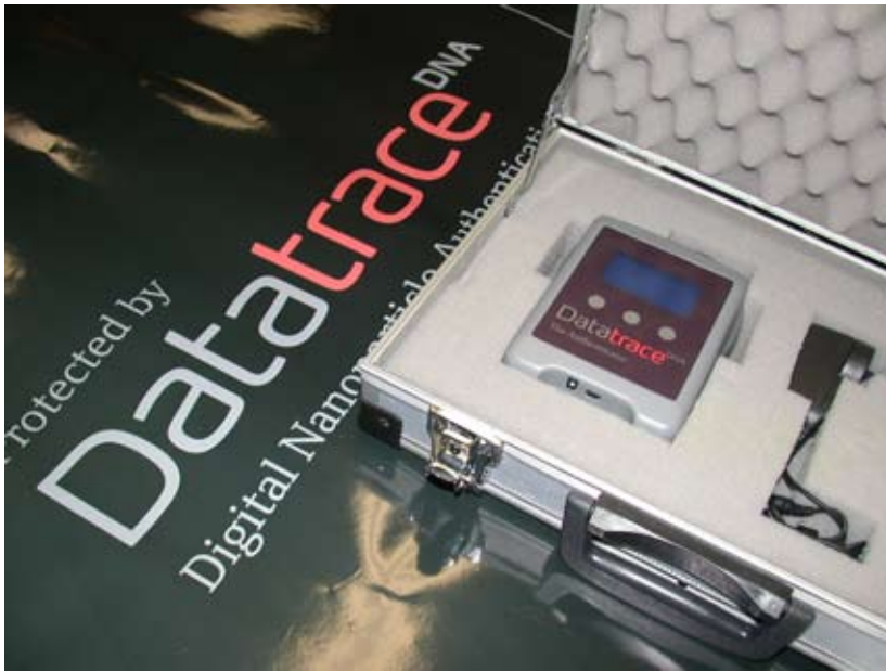
P1 Reader in its carrying case.