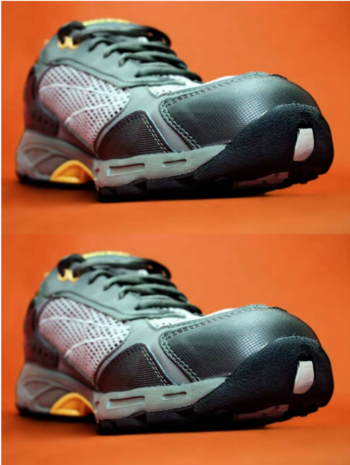
Counterfeiting: Which is the real product? (The bottom sneaker is the genuine product. Could you tell the difference?)