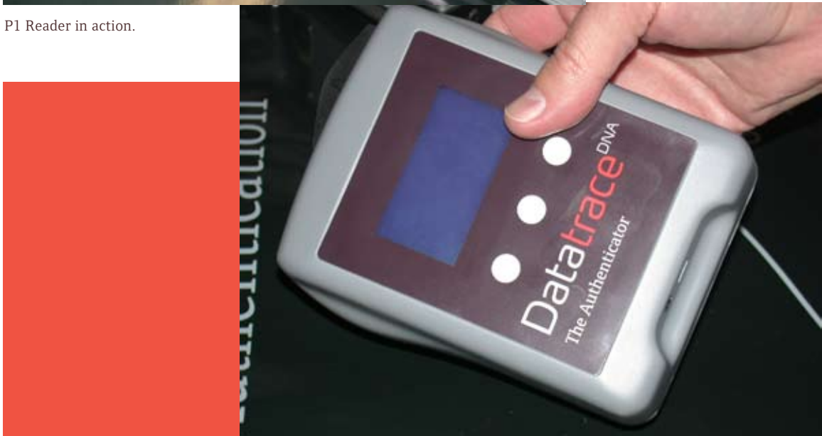
P1 Reader in action.