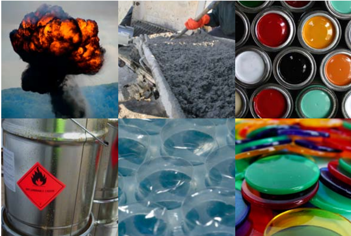
Relevant Industries. Chemicals, Concrete, Explosives, Paint, Plastic / Polymers.